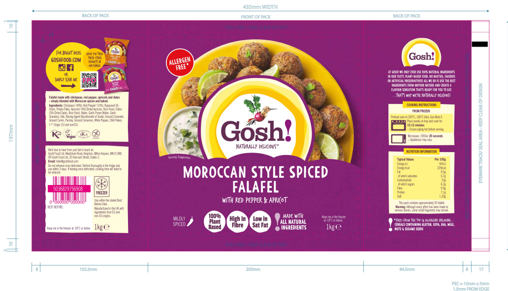
GOSHI FOODS 435mm x 220mm FROZEN CUTTER